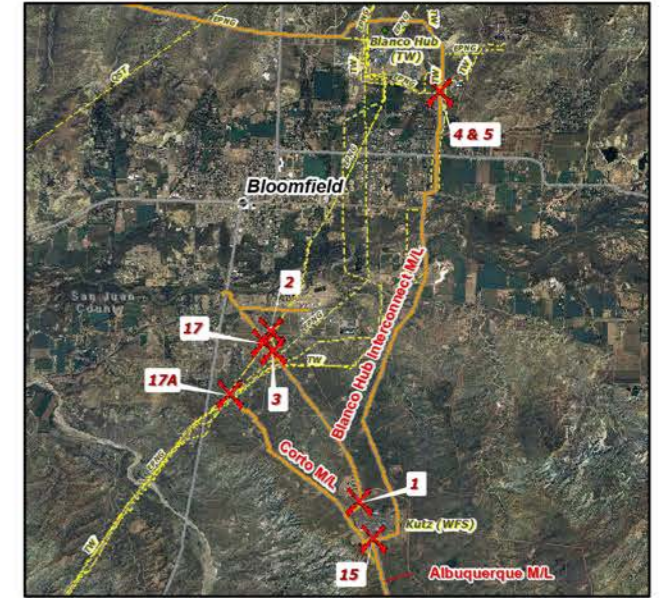
Torre Alta Station Area