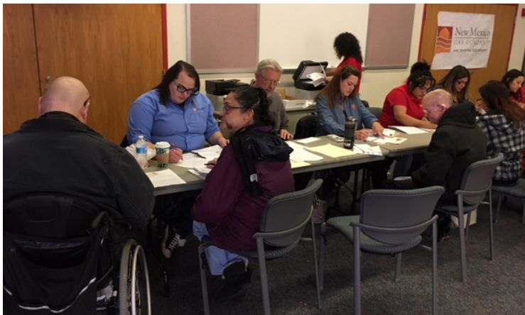
Our 2018 Heating Help & Energy Efficiency Fair helped more than 50 customers throughout the Albuquerque area. Join us in our efforts to help those who qualify at our 2019 Heating Help & Energy Efficiency Fair.